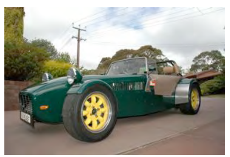
Tyres & Wheels Dunlop formula 195*60 front & 225*50 rear

4agze supercharger with water cooled turbocharger (complete with Haltec computer). Note : Twin charger kit worth $6,000 by itself. Gearbox is later model T50 with Albins close ratios