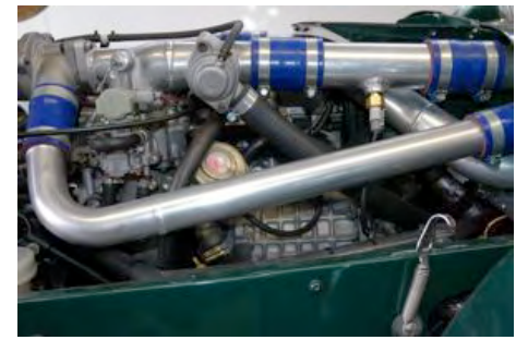
Standard supercharger and standard pulley