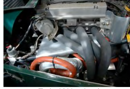
Turbo hidden there!