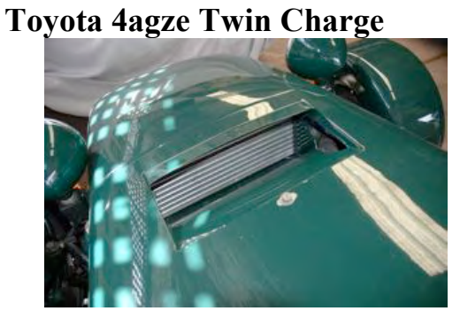
One of two intercoolers