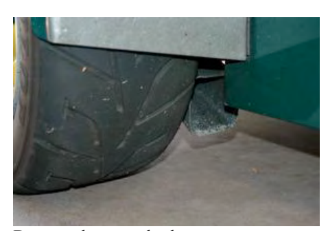
Duct work to rear brakes