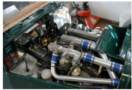
Lots of plumbing