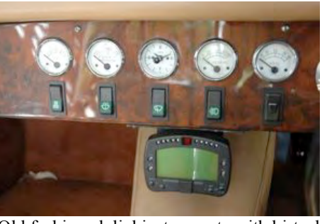
Old fashioned dial instruments with hi-tech performance tool